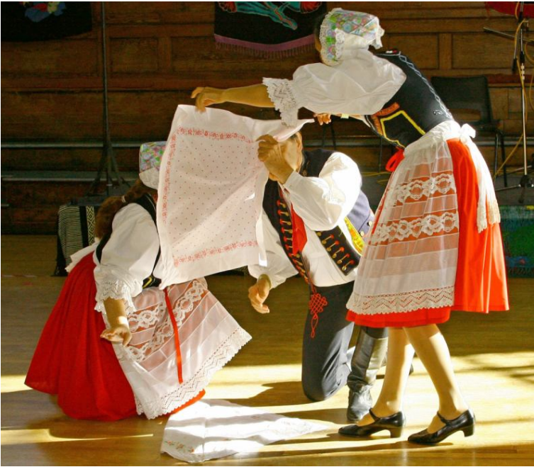
Troják at DATW 2010

The Beskydy Dancers has been a special part of our lives and an enduring influence for many of us, allowing us to explore and expand our love of Czech and Slovak folklor, culture, music and language. For those of us with Czech or Slovak heritage, the Beskydy Dancers was a vital connection to our roots. The final iteration of the group included dancers from a variety of backgrounds, some with previous dance experience, some without. Some of us had visited the Czech Republic or Slovakia and experienced the vibrant folk festival atmosphere, learned the language, or nurtured friendships and contacts. We all had one important thing in common: a dedication to understanding the character of the different regions, and crafting polished, engaging performances.